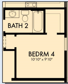
OPTIONAL BEDROOM 4 AT STUDY

2,099 - 2,126 sq. ft. • 3 - 4 Bedrooms • 3 Full Baths • 2 Car Garage