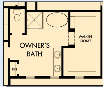
OPTIONAL SLIDE-IN TUB WITH SEPARATE SHOWER AT OWNER'S BATH