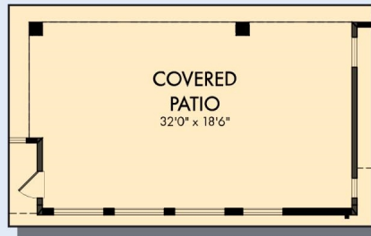
OPTIONAL EXTENDED COVERED PATIO

3,663 - 3,682 sq. ft. • 4 Bedrooms • 4 Full Baths • 1 Half Bath • 4 Car Garage