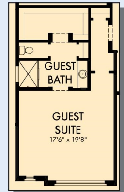
OPTIONAL GUEST SUITE AT BEDROOM 2 AND 3