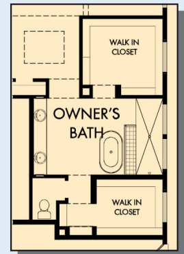
OPTIONAL FREE STADING TUB WITH SEPARATE SHOWER AT OWNER'S BATH