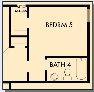
OPTIONAL BEDROOM 5 WITH BATH 4 AT RETREAT