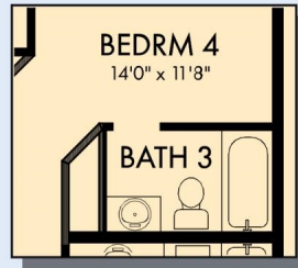
OPTIONAL BATH 3 AT BEDROOM 4