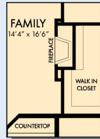
OPTIONAL WALL FIREPLACE AT FAMILY