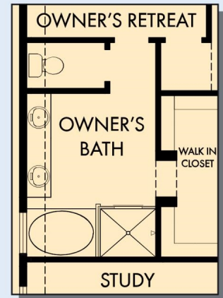
OPTIONAL SLIDE IN TUB WITH SEPARATE SHOWER AT OWNER'S BATH