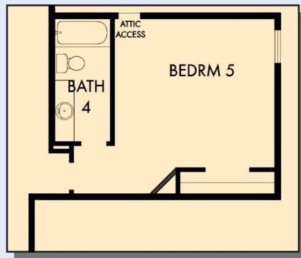
OPTIONAL BEDROOM 5 WITH BATH 4