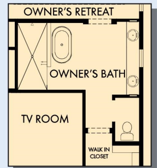
OPTIONAL FREE STANDING TUB AT OWNER'S BATH