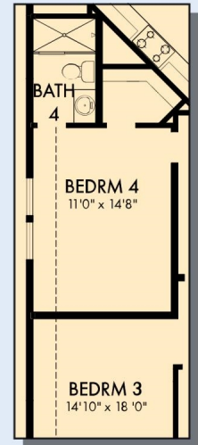
OPTIONAL BEDROOM 4 WITH BATH 4 AT RETREAT