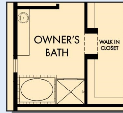
OPTIONAL DROP IN TUB WITH SEPARATE SHOWER AT OWNER'S BATH

2,771 - 2,794 sq. ft. • 3 Bedrooms • 2 Full Baths • 1 Half Bath • 3 Car Garage