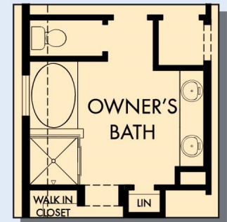
OPTIONAL SLIDE IN TUB WITH SEPARATE SHOWER AT OWNER'S BATH