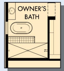
OPTIONAL FREE STANDING TUB AT OWNER'S BATH