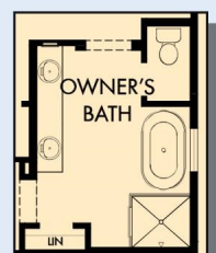
OPTIONAL FREE STANDING TUB WITH SEPARATE SHOWER AT OWNER'S BATH