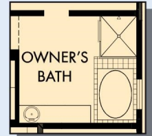
OPTIONAL DROP-IN TUB WITH SEPARATE SHOWER AT OWNER'S BATH