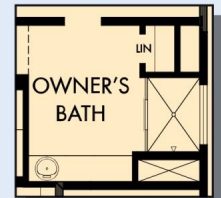
OPTIONAL SHOWER AT OWNER'S BATH