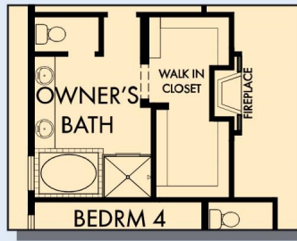
OPTIONAL WALL FIREPLACE AT FAMILY

2,742 - 2,752 sq. ft. • 4 Bedrooms • 3 Full Baths • 1 Half Bath • 3 Car Garage