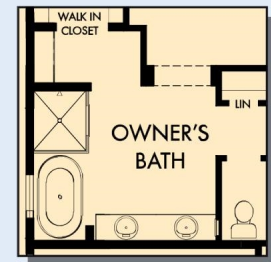
OPTIONAL FREESTANDING TUB WITH SEPARATE SHOWER AT OWNER'S BATH