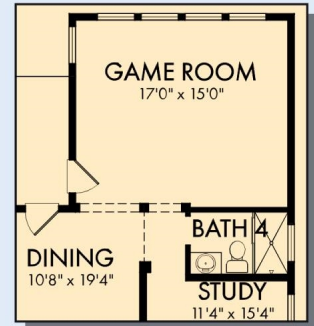
OPTIONAL GAME ROOM WITH BATH 4