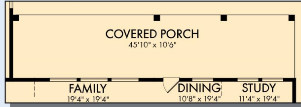
OPTIONAL EXTENDED COVERED PORCH