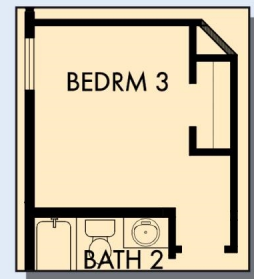
OPTIONAL BEDROOM 3 AT STUDY