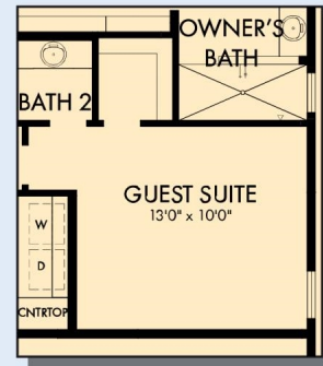
OPTIONAL GUEST SUITE AT BEDROOM 2 AND 3