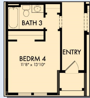
OPTIONAL BEDROOM 4 WITH BATH 3 AT STUDY