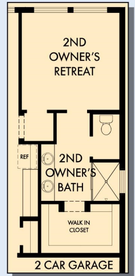
OPTIONAL 2ND OWNER'S RETREAT