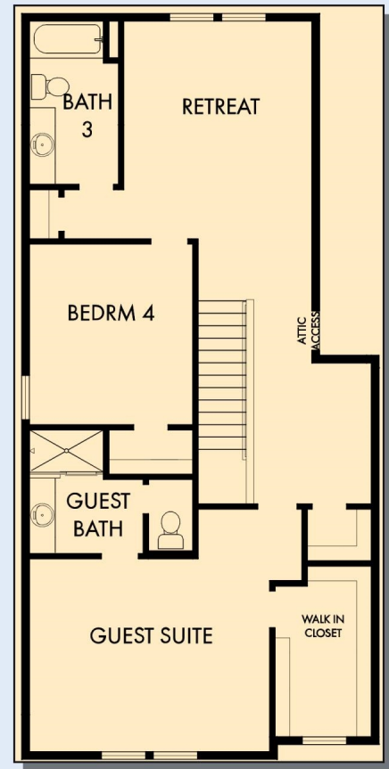
SECOND FLOOR WITH OPTIONAL GUEST SUITE WITH BATH

For additional options, please visit DavidWeekleyHomes.com