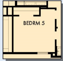
OPTIONAL BEDROOM 5 AT CRAFT