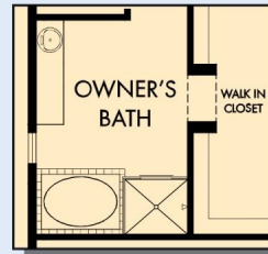
OPTIONAL DROP IN TUB WITH SEPARATE SHOWER AT OWNER'S BATH