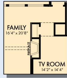
OPTIONAL WALL FIREPLACE AT FAMILY