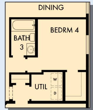
OPTIONAL BEDROOM 4 WITH BATH 3 AT STUDY