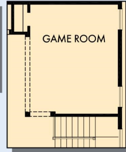
OPTIONAL GAME ROOM AT OPEN AREA