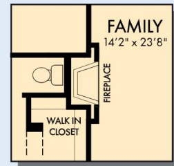
OPTIONAL WALL FIREPLACE AT FAMILY