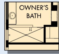
OPTIONAL SUPER SHOWER AT OWNER'S BATH