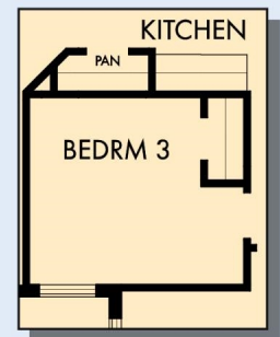
OPTIONAL BEDROOM 3 AT STUDY