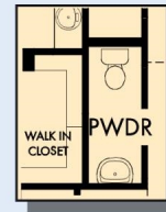
OPTIONAL POWDER BATH AT STAIRS