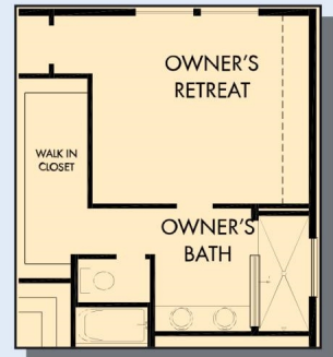
OPTIONAL WALK-IN SHOWER AT OWNER'S BATH