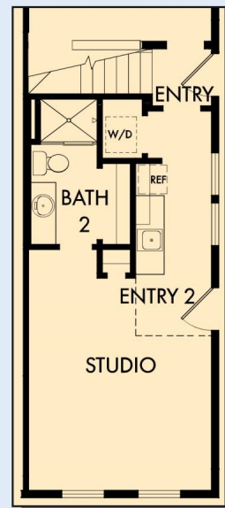
OPTIONAL ACCESSORY DWELLING UNIT STUDIO