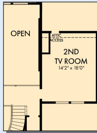
OPTIONAL EXTENDED 2ND TV ROOM