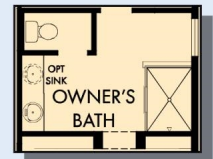
OPTIONAL SHOWER AT OWNER'S BATH