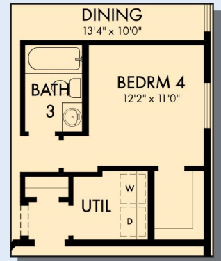
OPTIONAL BEDROOM 4 WITH BATH 3 AT STUDY