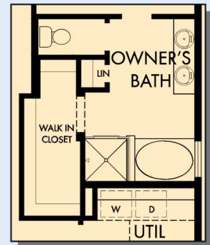
OPTIONAL SLIDE-IN TUB WITH SEPARATE SHOWER AT OWNER'S BATH