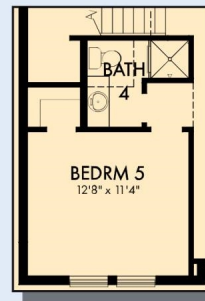
OPTIONAL BEDROOM 5 WITH BATH 4 AT STUDY