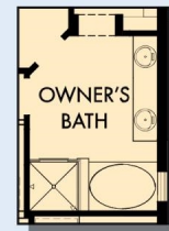
OPTIONAL FREE-STANDING TUB WITH SEPARATE SHOWER AT OWNER'S BATH