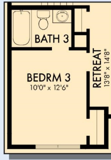
OPTIONAL BATH 3 AT BEDROOM 3