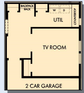
OPTIONAL TV ROOM AT GARAGE