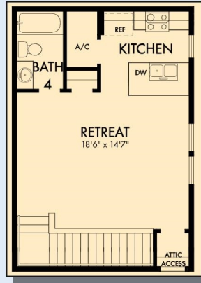
OPTIONAL SECOND FLOOR GARAGE RETREAT WITH KITCHEN ABOVE 3 CAR GARAGE

For additional options, please visit DavidWeekleyHomes.com