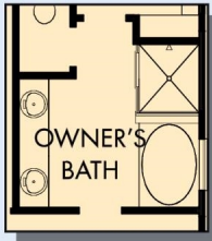
OPTIONAL SEPARATE TUB AND SHOWER AT OWNER'S BATH