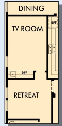
OPTIONAL TV ROOM AT BEDROOM 3