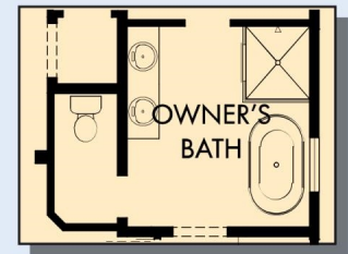
OPTIONAL FREE STANDING TUB WITH SEPARATE SHOWER AT OWNER'S BATH