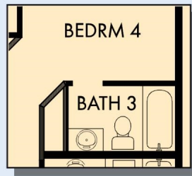
OPTIONAL BATH 3 AT BEDROOM 4