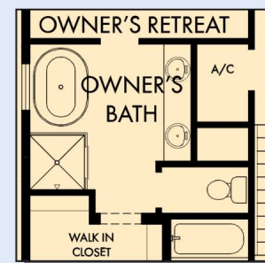
OPTIONAL FREE- STANDING TUB WITH SEPARATE SHOWER AT OWNER'S BATH

For additional options, please visit DavidWeekleyHomes.com