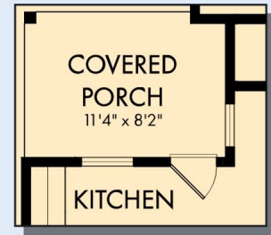
OPTIONAL COVERED PORCH