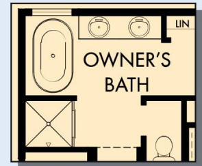
OPTIONAL FREE STANDING TUB WITH SEPARATE SHOWER AT OWNER'S BATH