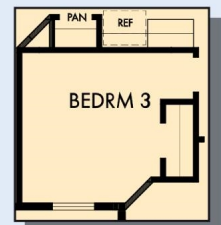
OPTIONAL BEDROOM 3 AT STUDY