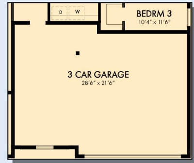
OPTIONAL 3 CAR GARAGE